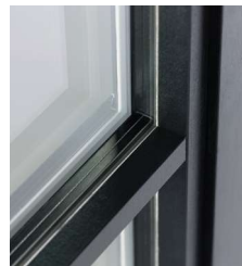
Black glass spacer shown

Choose from stainless steel, black or white glass spacers on select products to create a customized look. Add Full Divided Light grilles and the grille spacer bar between the glass will match the selected glass spacer color.