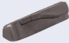
Oil Rubbed Bronze